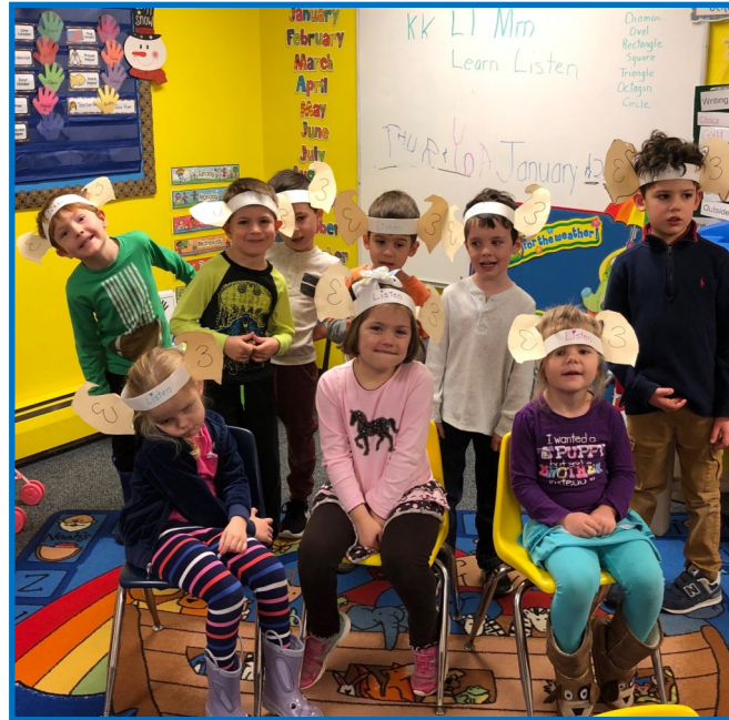
The Students have on their Listening Ears!